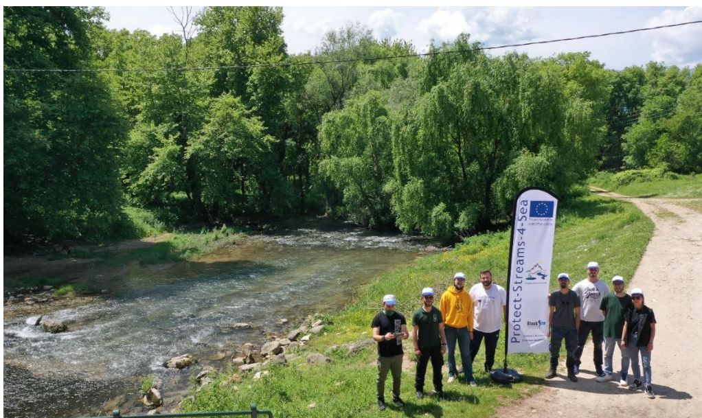
The research team and university students.

Please note that a photograph competition is going to take place with 3 awards for the students that took part in the awareness event. We would like to thank the students and the teachers of the 2 nd High School of Drama for this unforgettable happy day as well as ROOTS AMKE for the impeccable set up and coordination of this awareness event.