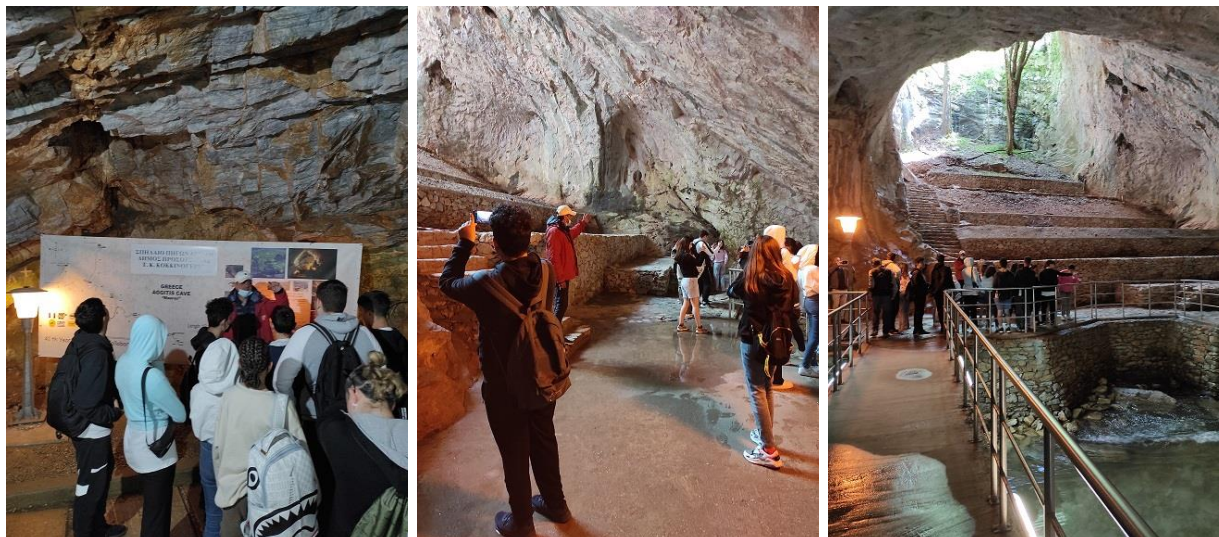
Informing the students about the Aggitis river cave (or Maara).