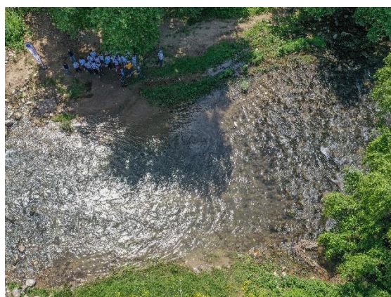
Informing students about the activities and the methodologies carried out in the context of Protect-Streams-4-Sea Project.