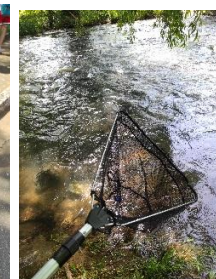
Litter collection in the riparian zone of Aggitis River.