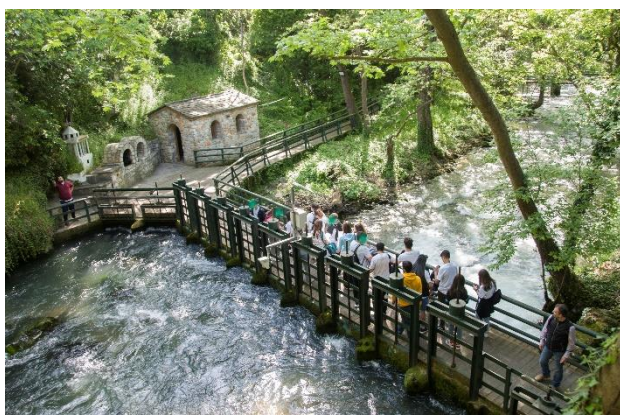
Informing students about the pilot area of Aggitis River Basin.