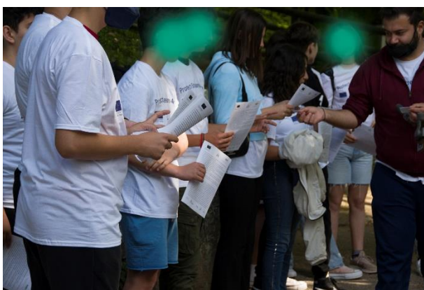
Informing the students about the scopes of the project Protect-Streams-4-Sea.

A visit/tour of students of the 2 nd High School of Drama, Greece took place on Tuesday, May 10, 2022 in the springs and the cave of Aggitis River (or Maara), in the Greek pilot area. The event was organized in the context of the Protect-Streams-4-Sea project by the GERi Lab of the Department of Forestry and Natural Environment Management of the School of Geotechnical Sciences of the International University of Greece and in collaboration with ROOTS AMKE.